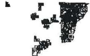
Relative location within Gadsden County

The Gadsden County Property Assessment Office makes every effort to produce the most accurate information possible. No warranties, expressed or implied, are provided for the data herein, it's use or interpretation. The assesment information is from the last certified taxroll. All data is subject to change before the next certified taxroll.